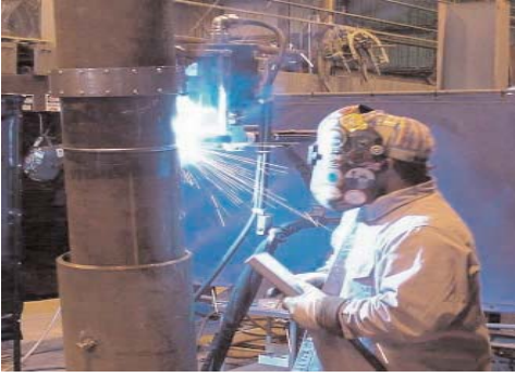
Welding in 2G Position for J-Lay