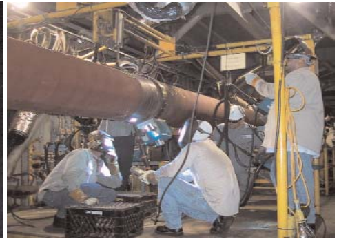
JBBS on Derrick / Lay Barge, DB16